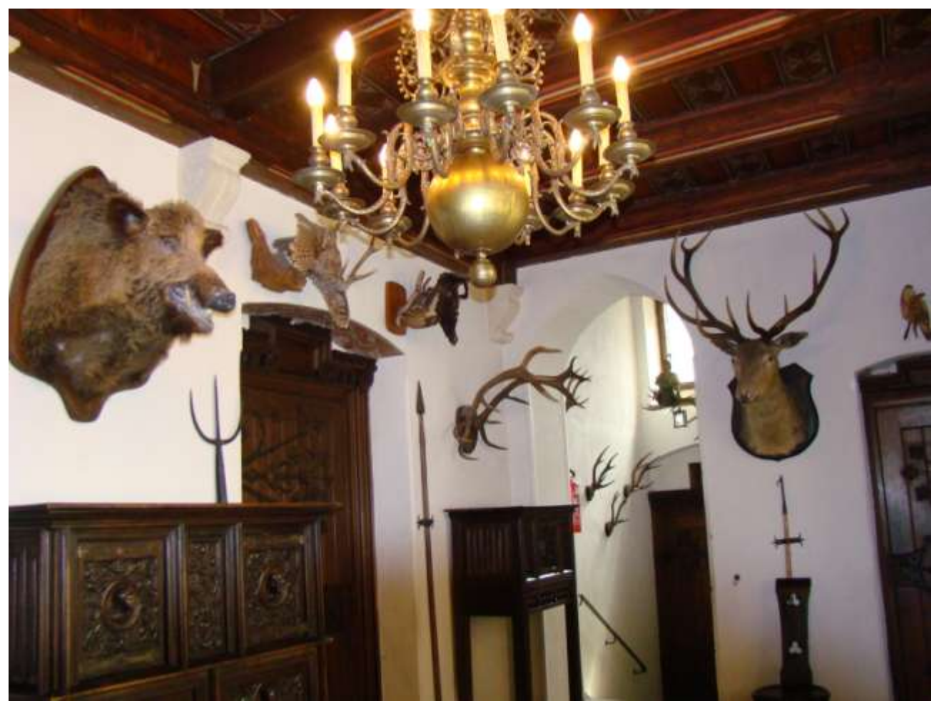
The Hunting Room in Reichsburg Castle. The antler motif is still de rigueur

Our guide shows us secret doorways leading to legendary castle passageways between the rooms. The privys hang out from the walls high above the ground, and were considered vulnerable to attack. We are shown only eight of the fifty rooms in the castle, but most others are empty. The Hunting Room has several mounted animal heads; the Armory has a large balcony offering gorgeous views of town, and up and down the river. The well in the courtyard is over 50 feet deep; our guide drops a small rock in so we can appreciate how long it takes to hit the water. A large mosaic of St. Christopher high on the keep has been preserved since medieval times, although the castle was rebuilt in the 1870's. We say goodbye to our compatriots as we stop for lunch at the café at the top of the hill. We are surprised to find that our meal of bratwurst with mixed salads and a glass of beer and wine comes to under 10 €. We ask for mustard, but our waiter acts confused. "Mustard??" he repeats. A German couple at the next table interprets for us, but we never get the mustard. Karen retrieves a yellow dispenser, but it contains mayo instead.