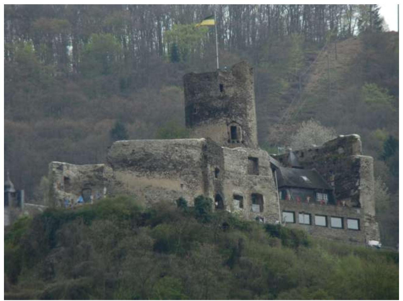
Castle ruins overlooking the Mosel River have been converted to a restaurant with a fine view

Within 90 minutes, we arrive at Traben-Trarbach and pass under the arch on the bridge. Fifteen minutes later, we arrive in Zell. At the Hotel Zum Grunen Kranz, we are greeted by an energetic German who speaks excellent English. We park in front along the promenade facing the river, and take several trips to bring all of our luggage up the small lift to Room 22 on the 3<sup>rd</sup> floor. Our room is fresh and bright, with a large balcony overlooking the Mosel.