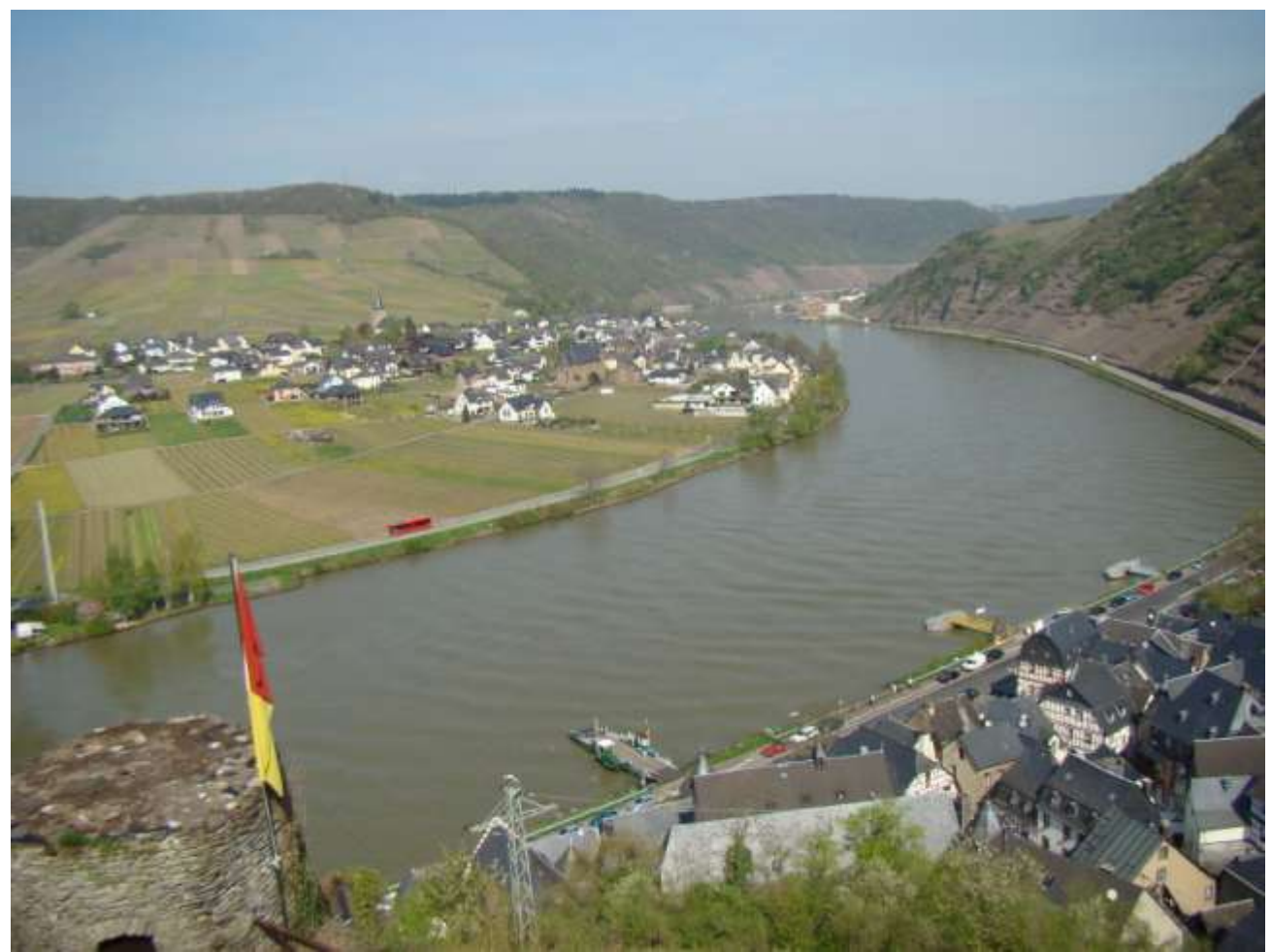
View of Bielstein from the Mitternich Castle watchtower

We exit the compound and follow the road up the hill south of the keep, past a vineyard. Soon we come to the Jewish cemetery in a quiet, peaceful grove of oak trees. The headstones, the surrounding fence, and even the trees are covered with lichens. Noticing fresh flowers placed on some of the graves, we learn that the cemetery is maintained by the Jewish community in Koblenz.