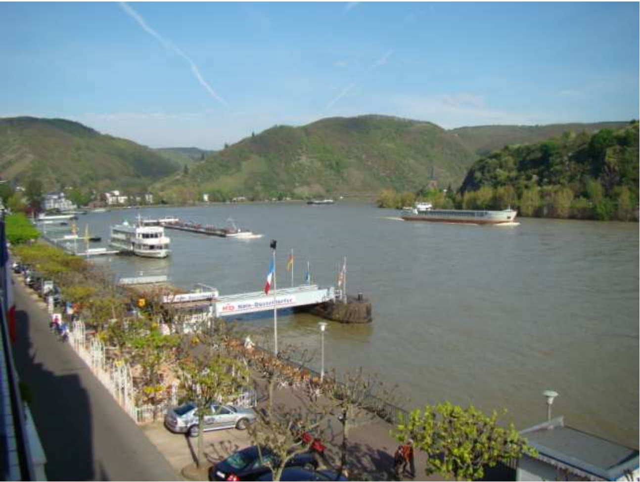
View of the Rhine River from the balcony of Hotel Günther Garni, Boppard