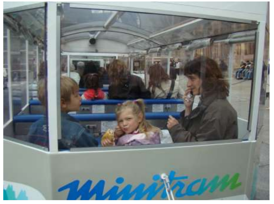
The antics of this young tourist were equally entertaining

We ascend the Cathedral tower via a spiraling staircase. all 66 meters to the observation platform near the top of the spires. The views of the city to the east and west are impressive. We can make out the route we took on the train to Petite France, past the St. Thomas Church landmark. Back in the plaza, we find the Office de Tourisme and purchase a map (better late than never) for 1 €. We retrace our route to Petite France in search of the Restaurant de St. Martin, recommended by our guidebook. We deduce that it might be located near the Pont St. Martin, and our hunch is correct.