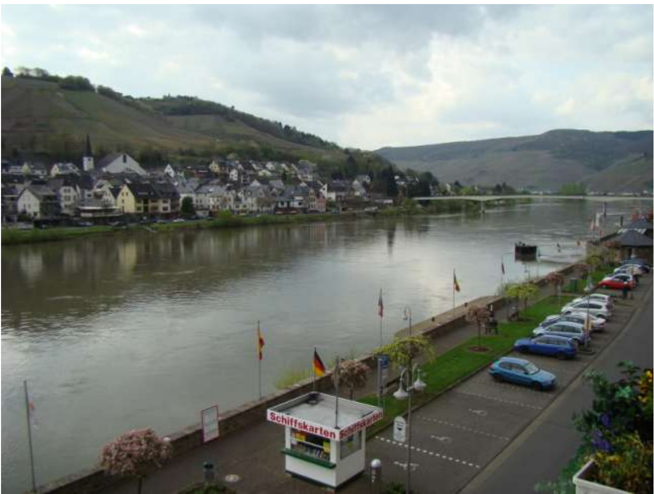
View of the Mosel River from our balcony at the Hotel Zum Grunen Kranz

We finally settle down to a wonderful dinner.