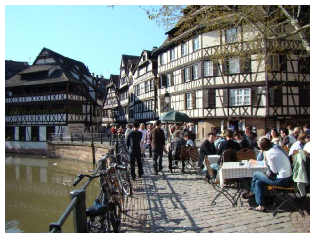
Half-timbered houses dating from the 1300's line a canal in Petite France

We return by Tram D-Rotunde to the Place de Gare. From there, it's a short walk to the Wodli Garage. When we arrive at the exit check point, there is only an automated machine that accepts only debit cards for payment. Not good if all you have is cash, travelers cheques, or a credit card!