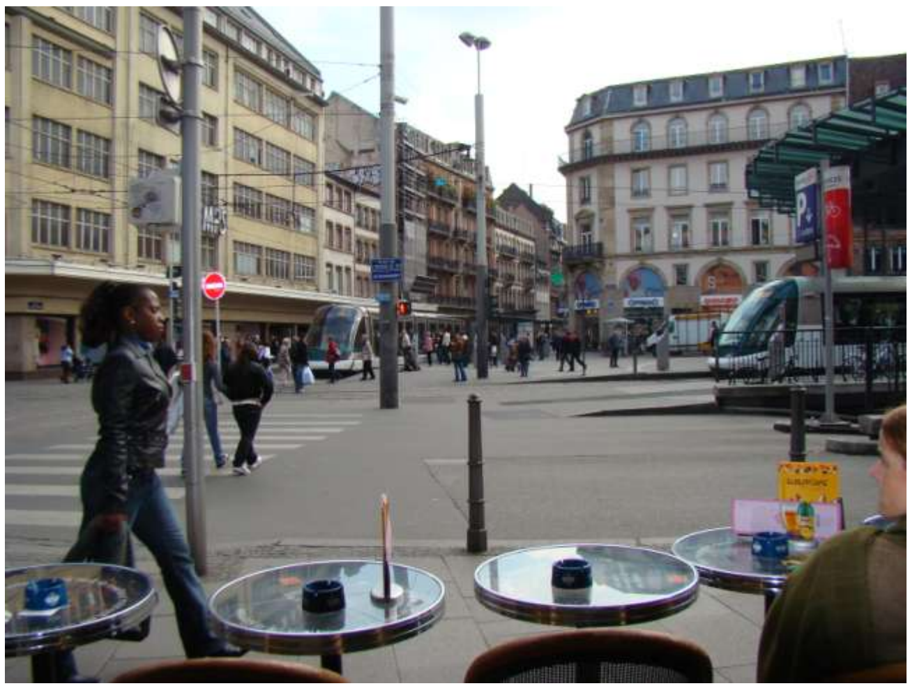
View from a sidewalk café near the Cathedral in Strasbourg

We leave on our day trip to <u>Strasbourg</u> around 10:30am. We spend a few minutes figuring out how to program the country code and town into the GPS, and then head up the hill from the hotel. As we make our way down a narrow street that runs behind the town and connects with Leopoldstrasse just before the tunnel, we are mystified by cars parked helter-skelter in both directions along the roadside. As we head out of town, the GPS proves to be a masterful guide, directing us in counter-intuitive fashion past the A-5 turnoff to the A-35 and into France. The GPS continues to direct us flawlessly into Strasbourg, at which point we are on our own.