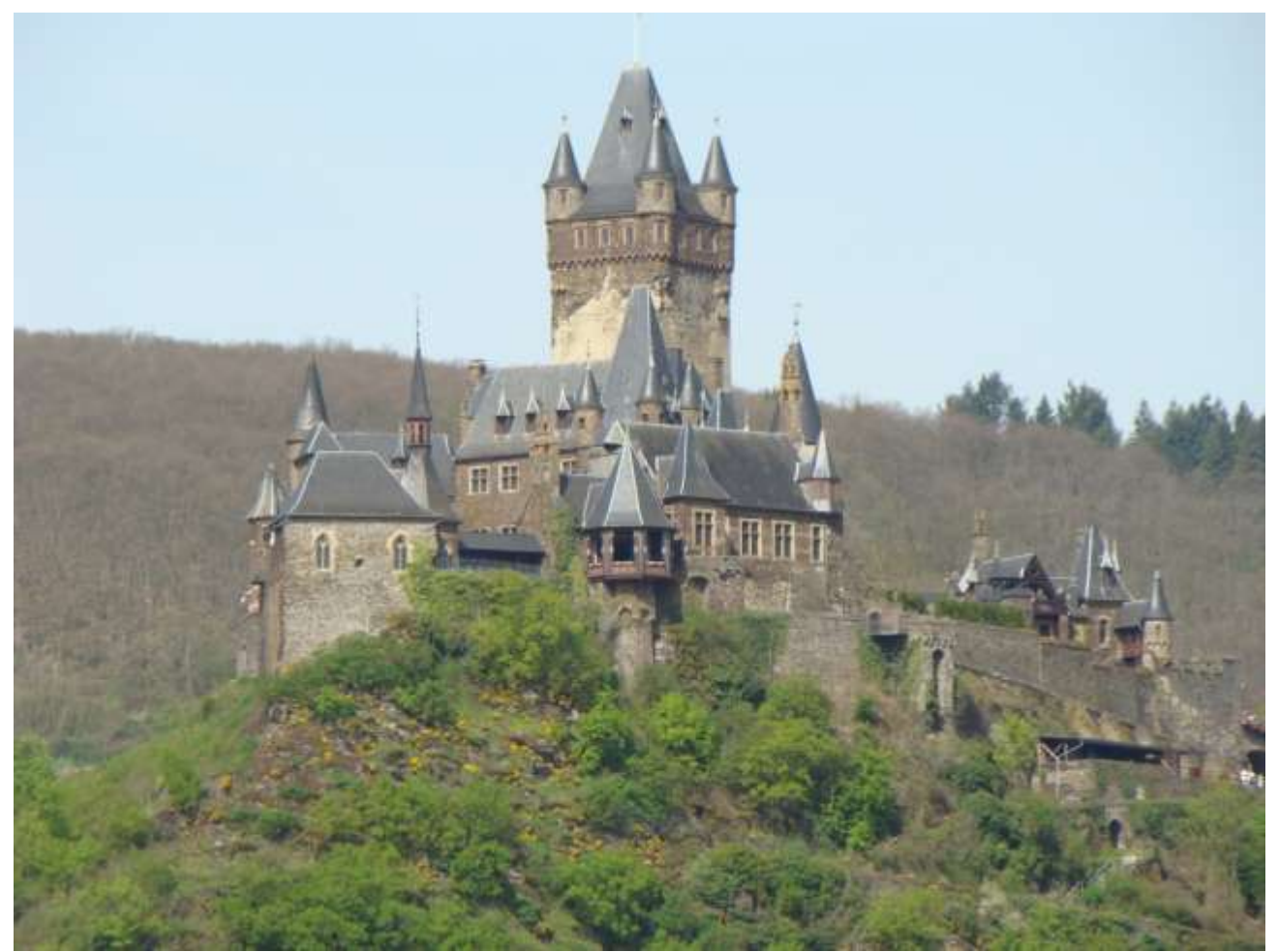
The Reichsburg Castle oversees the town of Cochem

The tour is in German, but our guide offers occasional explanations in English. We meet two American girls who work for Price Waterhouse in Berlin. The gal from L.A. says she arrived in January and says that we came at a really good time; the weather has been crappy and depressing until now. She and her friend like to take day trips from Berlin. She says she is on assignment for six months, but already sounds homesick.